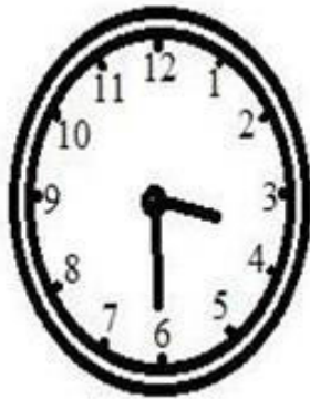
Time they left in afternoon