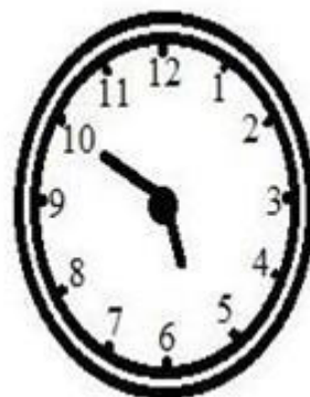
Time they came back in evening